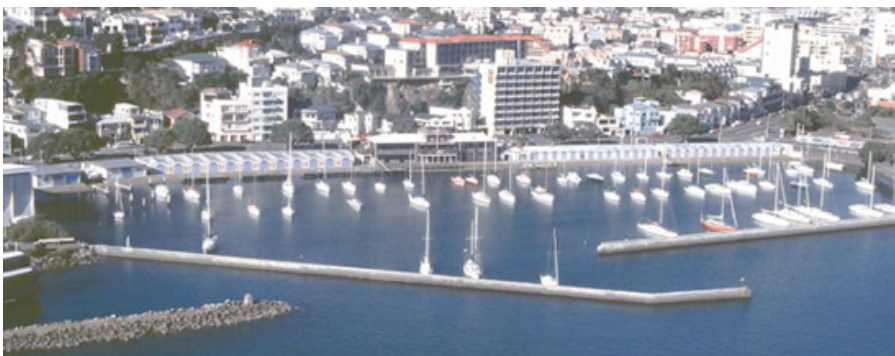
ROYAL PORT NICHOLSON YC

All competitors must qualify to compete in the Worlds, entry to which is limited to 80 boats, plus the reigning World Champion. This ensures competition at the highest level